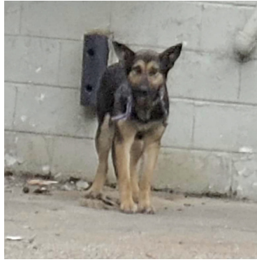
LOLA hit by a car & heartworm positive