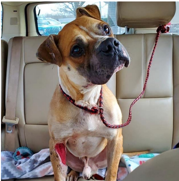
BRUCE WAYNE severe injury to his front leg