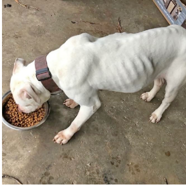
STAR extremely emaciated