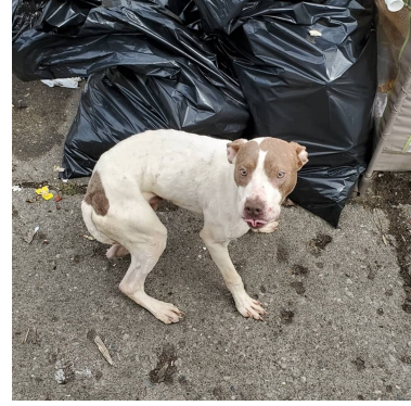
CYRUS emaciated & found digging in trash for food

CLICK HERE To have your donation matched up to $5,000