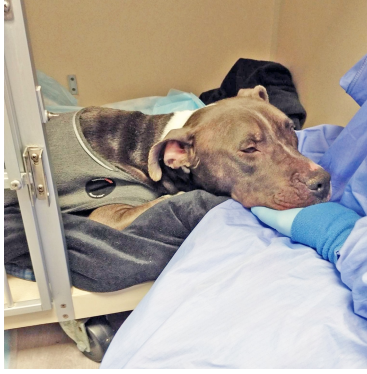
DESTINY extremely emaciated with neurological issues