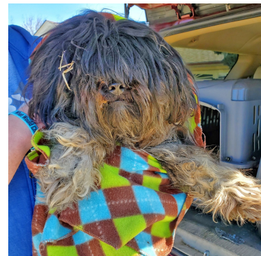
LUIGI severely matted