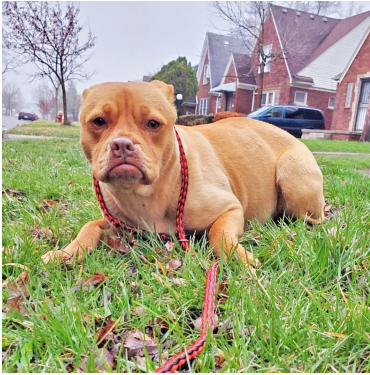
CRICKET thrown out of a car pregnant