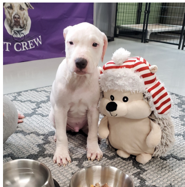
STARK rescued from being used by dog fighters