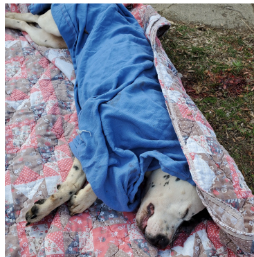
PATCHES shot in the head