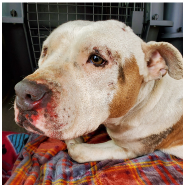
ZOEY pregnant & hit by a car