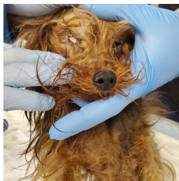
SHAMROCK extremely emaciated & neglected, blind, unable to walk & multiple soars