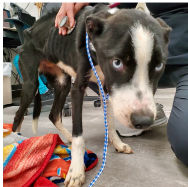
RYDER extremely emaciated & hospitalized 2 days

rescued 92 dogs and have accumulated over $32,000 in veterinary bills to save them.